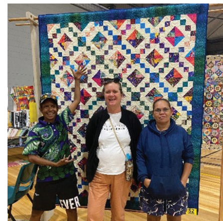
Quilt displayed at Mossman Airing of the Quilts event.