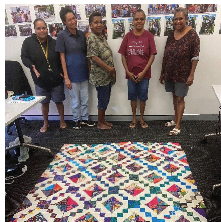
Students arranging the blocks for Jewel-box raffle quilt

The centre of the quilt represents the rainforest, and the edges represent the coral reef, Our Heart.